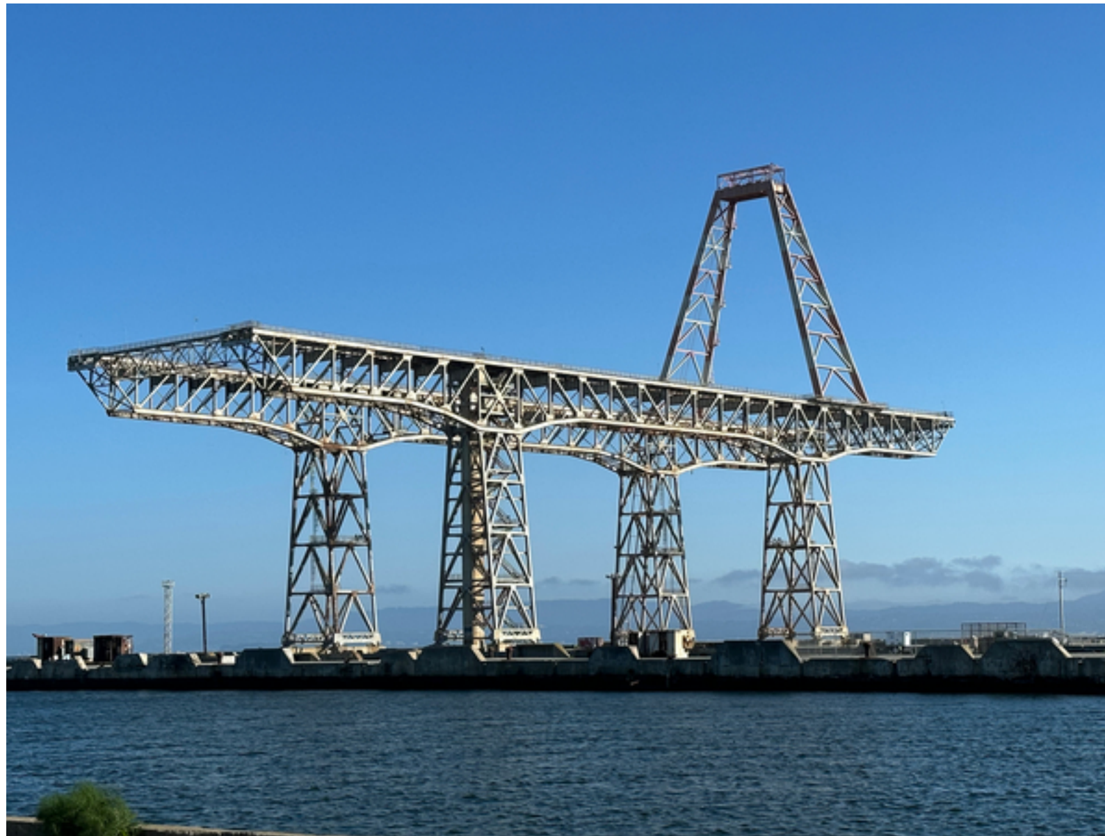
The 8400 hundred ton Hunters Point Crane

Past projects of the pair include Lumière at the Penshaw monument in the UK. The illumination and live sounds will be presented at Shipyard Building 101 on October 19, 6 – 10 PM. The crane can also be viewed from any other locations where it is visible, with the option to tune in to the streamed soundscape presentation.